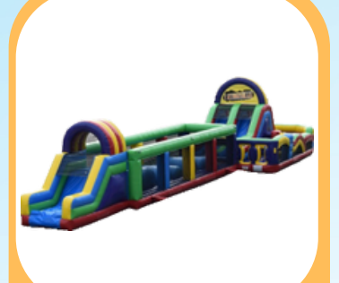
81' Extreme Warrior Jump$83081'L x 19'W x 17'H