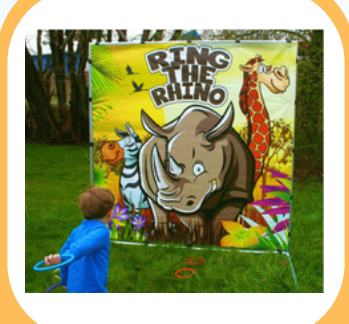
Ring the Rhino $75