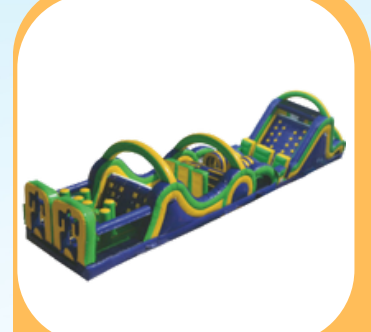
70' Fun Run $730 70'L x 16'W x 16'H