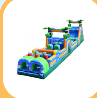
75' Tropical Obstacle $760 70'L x 16'W x 16'H