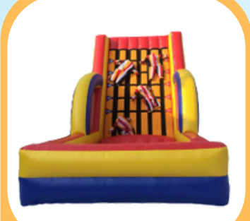
$385 28'L x 29'W x 12'H