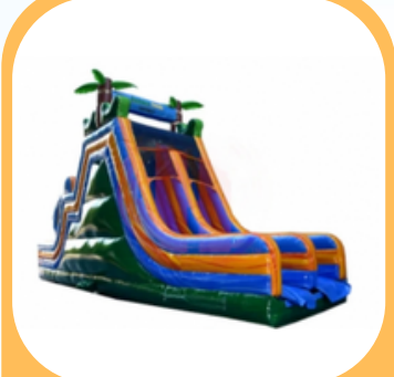
35' Tropical Warped Wall & Slide $530 52'L x 12'W x 14'H