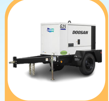
X-Large Generator 25KW Call With Fuel