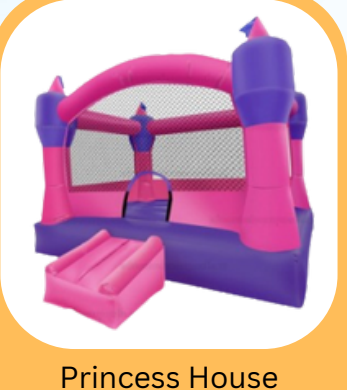
$295 13'L x 13'W x 14'H