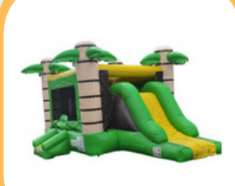
Tropical Combo 20FT $375 20'L x 14'W x 12'H