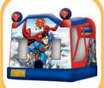
$395 21'L x 16'W x 15'H