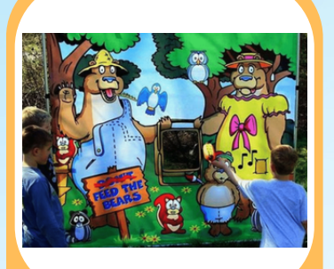
Feed the Bears $75