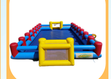
Inflatable Soccer Arena $395 15'W x 25'L x 7'H