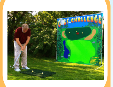
Golf Challenge $75