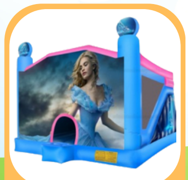
Cinderella Combo $370 20'L x 20'W x 20'H