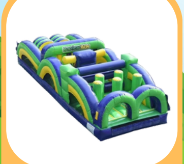
30' Fun Run $430 29'L x 19'W x 17'H