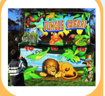
Jungle Safari $75