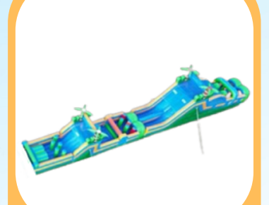
80' Tropical Obstacle $795 71'L x 16'W x 13'H