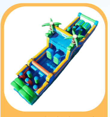
40' Tropical Obstacle $530 40'L x 14'W x 13'H