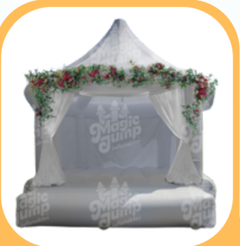
Wedding Castle $450 20'L x 18'W x 20'H

*All inflatable pricing reflect 4 hour rentals* - *Tax and Delivery not included in price*