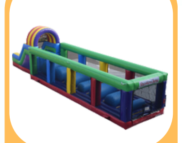
52' Warrior Jump $580 52'L x 12'W x 14'H