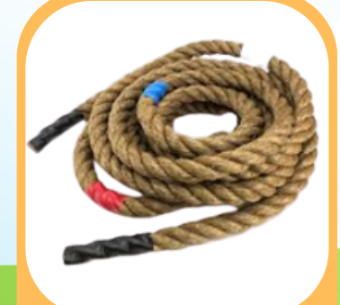
Tug of War Rope 50Ft $35