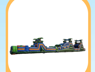
120' Tropical Obstacle $1330 100'L x 16'W x 16'H