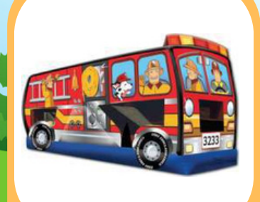
$395 30'L x 11'W x 12'H