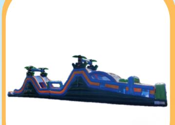
85' Tropical Obstacle $850 81'L x 19'W x 17'H