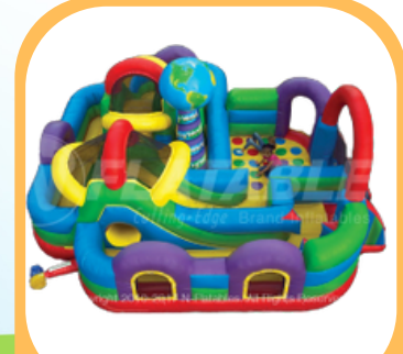
Wacky World $705 28'L x 29'W x 12'H