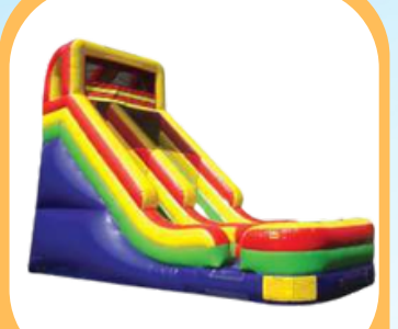
21FT Massive Slide $495 32'L x 18'W x 24'H