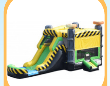
$395 27'L, 16'W, 14'H