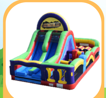
30' Compacted $680 29'L x 19'W x 17'H