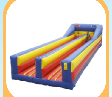
Bungee Run $385 37'L x 11'W x 8'H