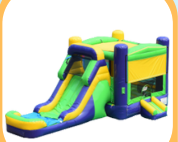
$395 27'L x 16'W x 12'H