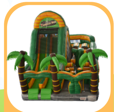
2 Lane Tropical $680 29'L x 16'W x 16'H

*All inflatable pricing reflect 4 hour rentals* *Tax and Delivery not included in price*