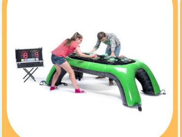
Interactive Play Table $300