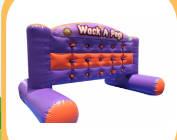
Wack a Peg $250