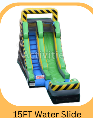
$495 28'L x 11'W x 15'H