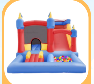
Toddler Slide & Ball Pit $345 14'L x 13'w x 14'H