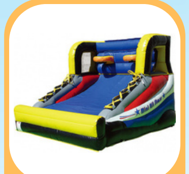
$215 10'L x 9'W x 8'H