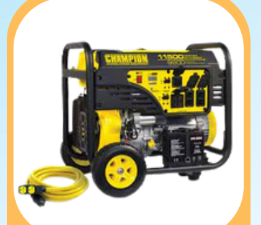
Medium Generator 10KW $150 With Fuel