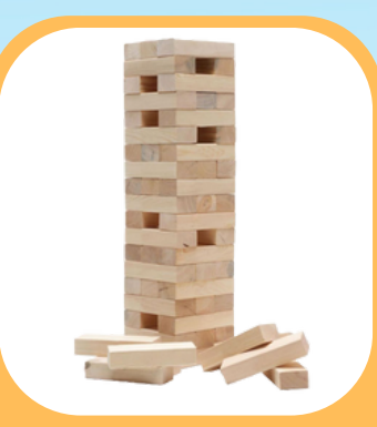
Giant Jenga $50