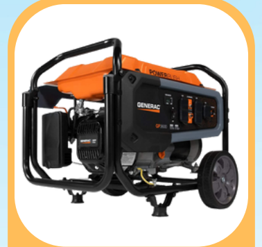
$150 With Fuel