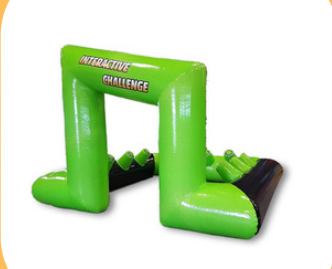
Inflatable Interactive Challenge $400