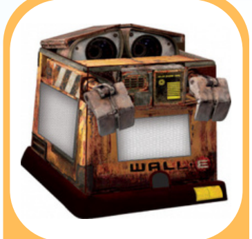
Wall-E Combo $345 21'W x 16'L x 16'H