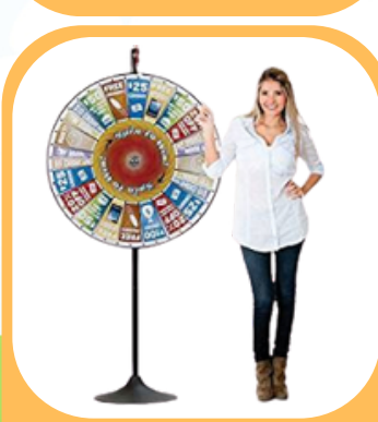
36" Prize Wheel $80

*All game pricing reflect 4 hour rentals* *Tax and Delivery not included in price*