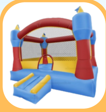
Fantastic Castle $295 13'L x 14'W x 13'H