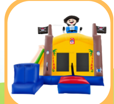
Pirate Combo $345 20'L x 20'W x 20'H

*All inflatable pricing reflect 4 hour rentals* *Tax and Delivery not included in price*