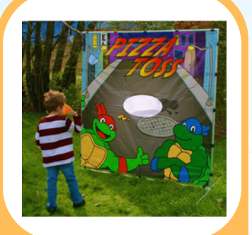
Pizza Toss $75