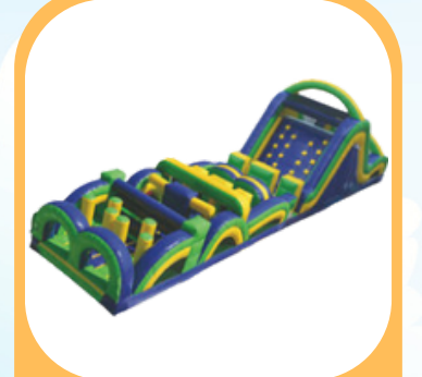
60' Rad Run $705 61'L x 16'W x 16'H