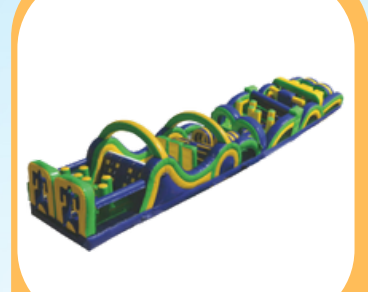
71' Fun Run $730 71'L x 16'W x 13'H