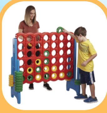
Giant Connect 4 $80