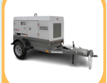
Large Generator 19.5KW Call With Fuel