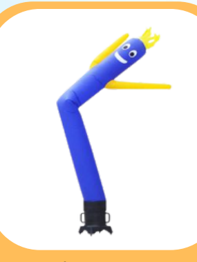
Sky Dancer $75