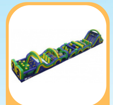
100' Radical Run $1030 100'L x 16'W x 16'H