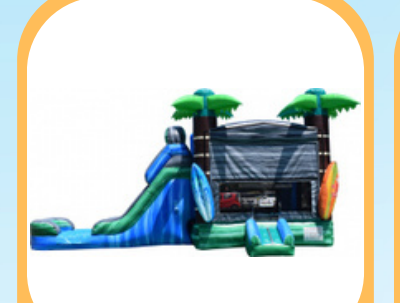
Tropical Combo $395 27'L x 16'W x 11'H