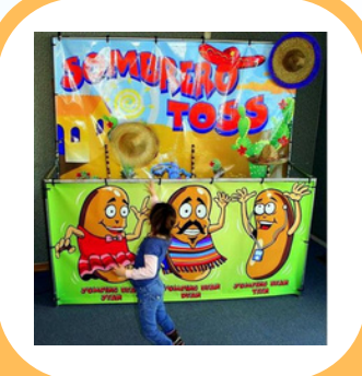
Sombrero Toss $75