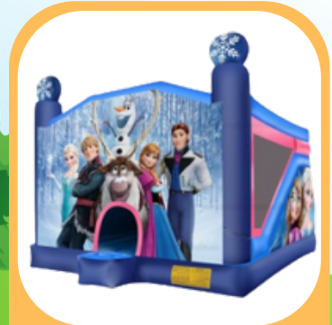
Frozen Combo $370 19'L x 19'W x 19'H