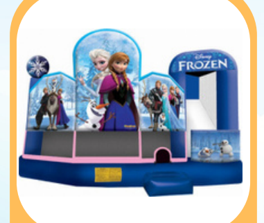
$395 20'W x 19'L x 15'H