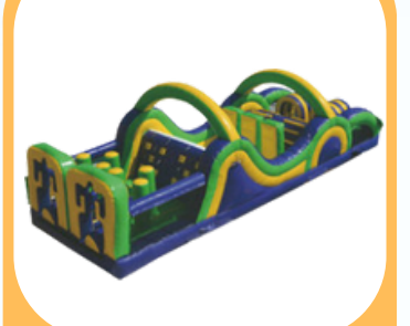
40' Rad Run $495 40'L x 14'W x 13'H