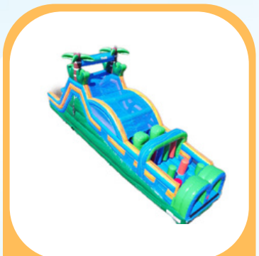
45' Tropical Obstacle $630 51'L x 11'W x 15'H