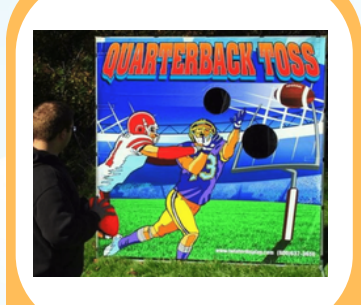
Quarterback Toss $75