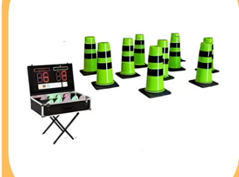
Interactive Play Cones $300