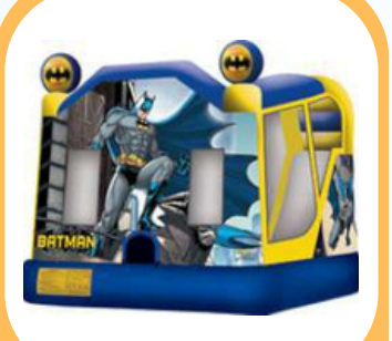
$395 18'W x 16'L x 15'H