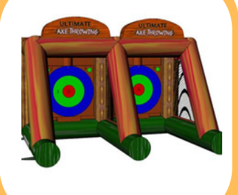
$310 10'L x 14'W x 10'H