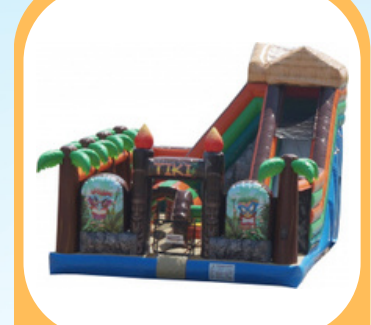
Tiki Tropical Combo $545 20'L x 20'W x 20'H