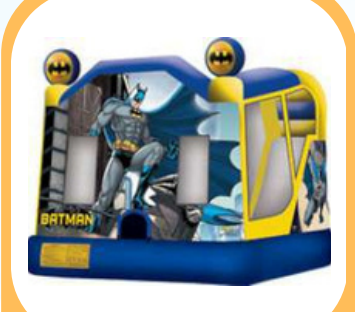
Batman Combo $385 18'W x 16'L x 15'H