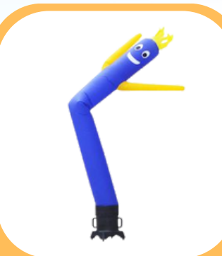
Sky Dancers $50