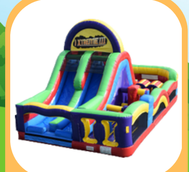
30 Ft Compacted $650 29'L x 19'W x 17'H