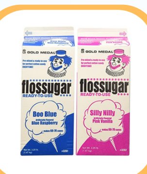
50 Servings Cotton Candy with cone or bags $40