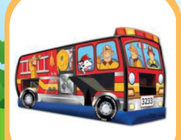
Fire Truck Combo $385 30'L x 11'W x 12'H