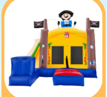
Pirate Combo $325 20'L x 20'W x 20'H