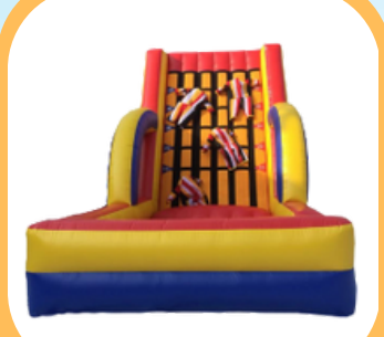
Sticky Velcro Wall $375 28'L x 29'W x 12'H