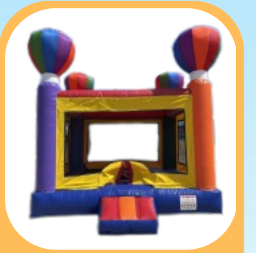
Balloon Castle $265 13'L x 13'W x 15'H