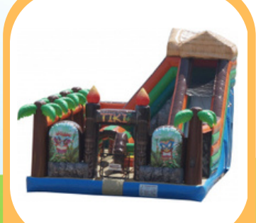
Tiki Tropical Island $525 26'L x 15'W x 17'H