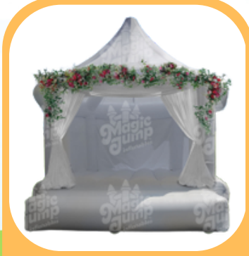
Wedding Castle $550 20'L x 18'W x 20'H

*All inflatable pricing reflect 4 hour rentals* *Tax and Delivery not included in price*