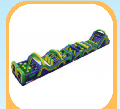
100FT Radical Run $885 100'L x 16'W x 16'H