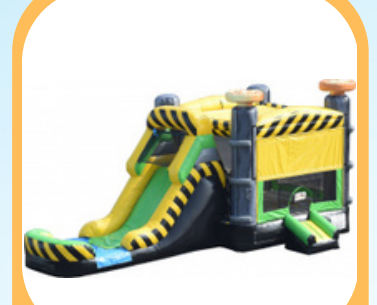
Caustic Combo $365 27'L, 16'W, 14'H