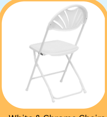
White & Chrome Chairs $2.50 Per Day