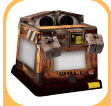
Wall-E Combo $385 21'W x 16'L x 16'H