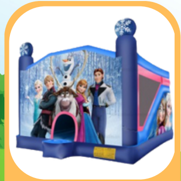
Frozen Combo $345 19'L x 19'W x 19'H