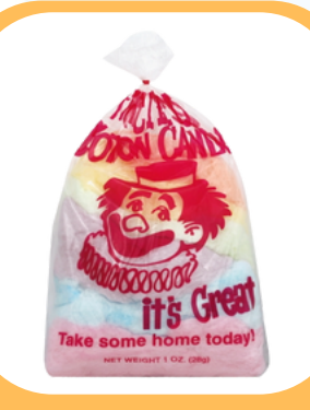
Pre-Made Cotton Candy