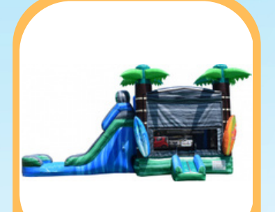
Tropical Combo $365 27'L x 16'W x 11'H