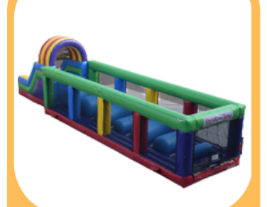
$585 $2°L x 12°W x 14°H