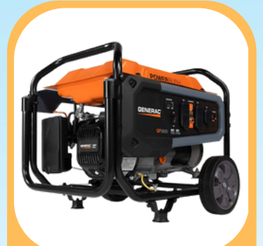
Small Generator 5KW $150 With Fuel