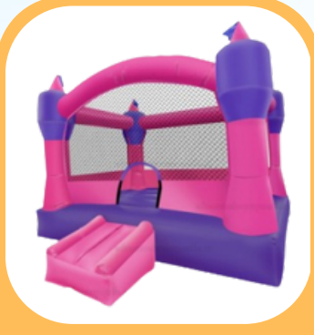
Princess House $250 13'L x 13'W x 14'H