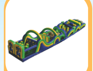
71FT FunRun $725 71'L x 16'W x 13'H