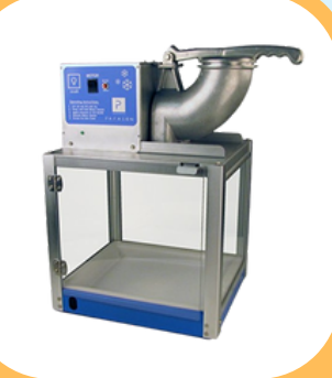
Snow Cone Machine with 50 supplies (not including ice)