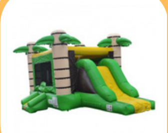
Tropical Combo 20FT $285 20'L x 14'W x 12'H