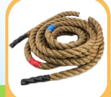
Tug of War Rope 50Ft $35