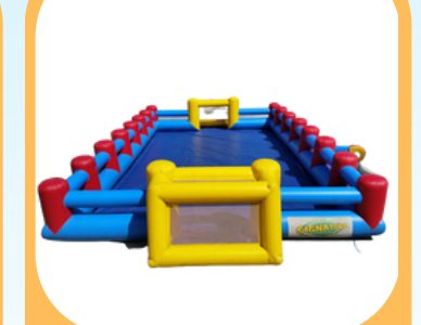
Inflatable Soccer Arena $365 15'W x 25'L x 7'H