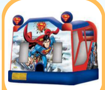
Superman Combo $385 21'L x 16'W x 15'H