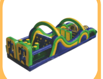
40ft Rad Run $435 40'L x 14'W x 13'H