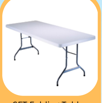
6FT Folding Tables $12