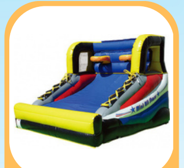
$175 10'L x 9'W x 8'H