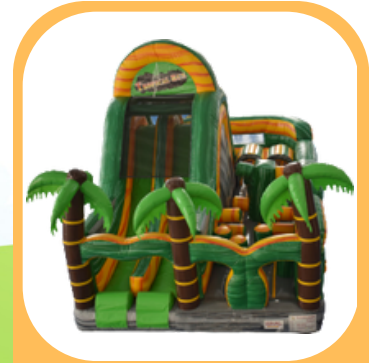
2 Lane Tropical $625 29'L x 16'W x 16'H

*All inflatable pricing reflect 4 hour rentals* *Tax and Delivery not included in price*