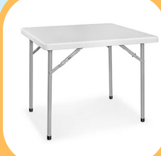
34" Square Table $10 Per Day