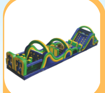
70FT Fun Run $685 70'L x 16'W x 16'H