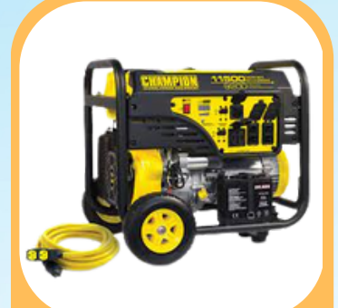
Medium Generator 10KW $225 With Fuel