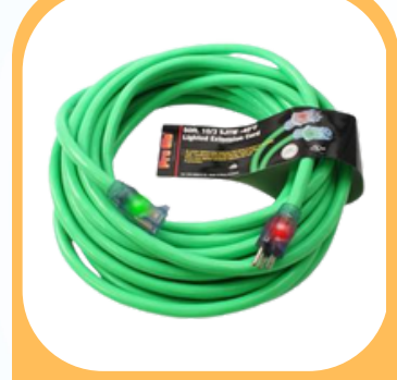
Extension Cords 50FT $10