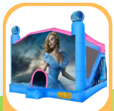
Cinderella Combo $350 20'L x 20'W x 20'H