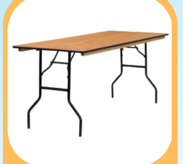
8Ft Wooden Tables $12