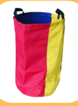
Potato Sacks $35