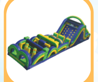
61FT Rad Run $655 61'L x 16'W x 16'H