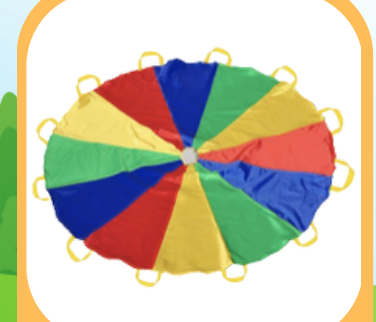
12Ft Parachute $25