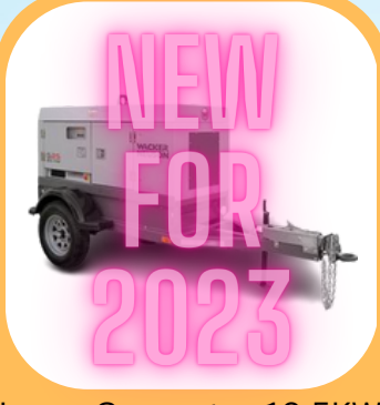
Large Generator 19.5KW Call With Fuel