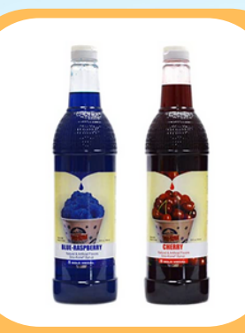
50 ServingsSnow Cone Syrup & Cups /No Ice $30