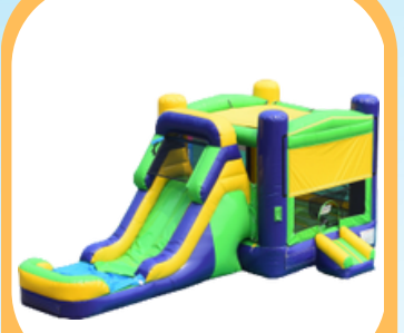
Radical Combo $365 27'L x 16'W x 12'H