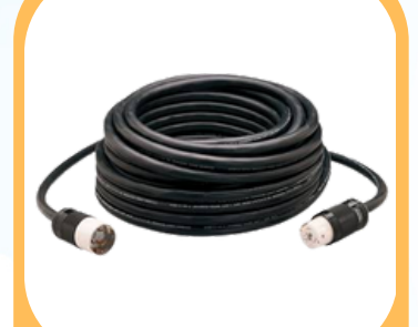
50A Extension 50FT $30