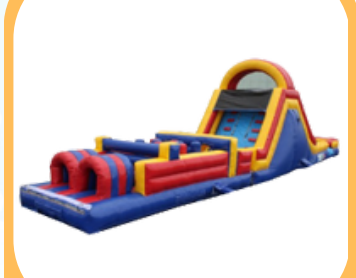
51FT Course $525 51'L x 11'W x 15'H