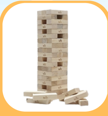
Giant Jenga $50