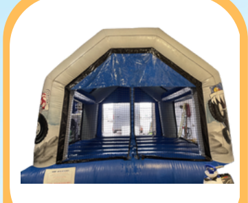
Monster Truck Castle $295 20'L x 20'W x 20'H