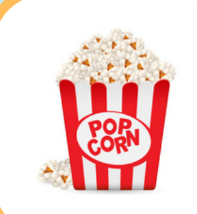
50 Popcorn Servings & Bags