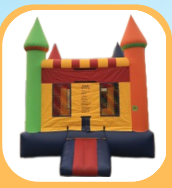
Colourful Castle $265 14L x 15W x 16H