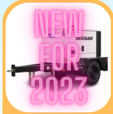
X-Large Generator 25KW Call With Fuel