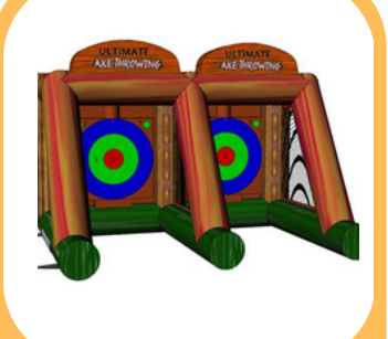
Archery/Axe Arena $350 10'L x 14'W x 10'H