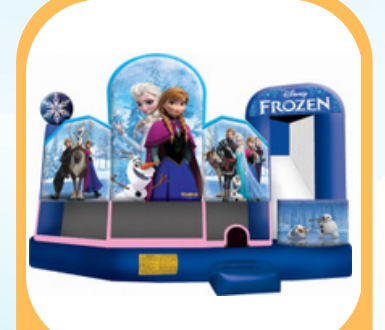
Large Frozen Combo $385 20'W x 19'L x 15'H