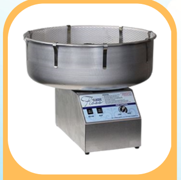
Cotton Candy Machine with 50 supplies