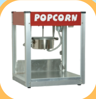
16oz Popcorn Machine Professional Grade /w 50 supplies $175 Per Day