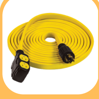
50A Converter $30