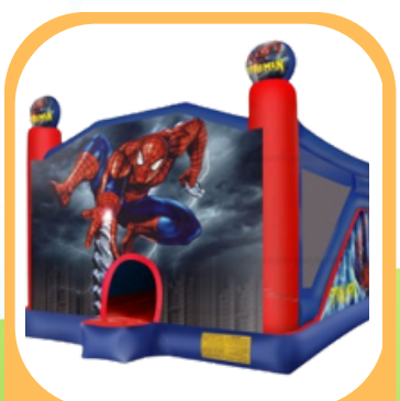
Spiderman Combo $365 20'L x 20'W x 20'H

*All inflatable pricing reflect 4 hour rentals* *Tax and Delivery not included in price*