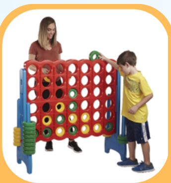
Giant Connect 4 $50