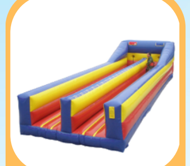
Bungee Run $345 37'L x 11'W x 8'H