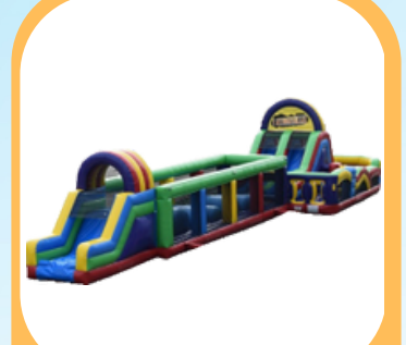
81FT Extreme Warrior Jump $925 81'L x 19'W x 17'H