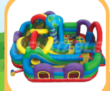
Wacky World $685 28'L x 29'W x 12'H